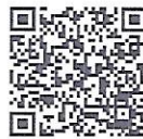
Scan to schedule

Please call: 1-800-RED CROSS (1-800-733-2767) to schedule an appointment.